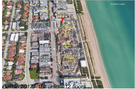
Built in 2017 - 151 units on 12 floors