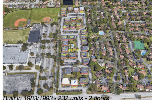
Built in 1983/1993 - 232 units - 2 floors