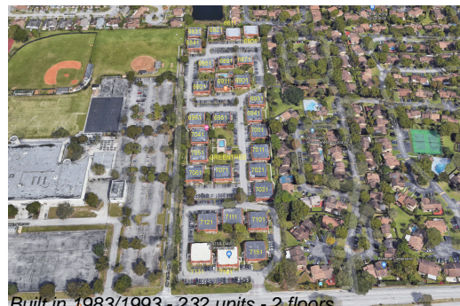
Built in 1983/1993 - 232 units - 2 floors