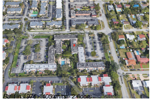
Built in 1976 - 405 units - 2 floors