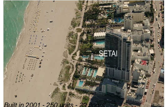
Built in 2001 - 250 units - 39