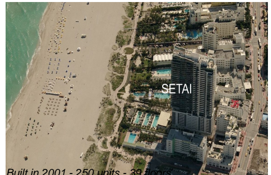
Built in 2001 - 250 units - 39 floors