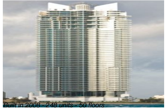
Built in 2008 - 248 units - 50 floors