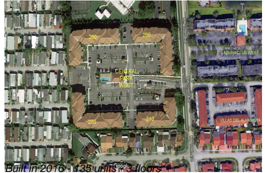
Built in 2016 - 135 units, 13 floors