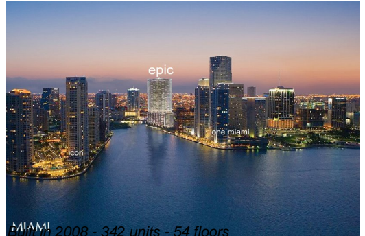
MIAMI 2008 - 342 units - 54 floors