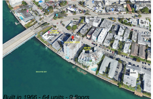
Built in 1966 - 64 units - 9 floors