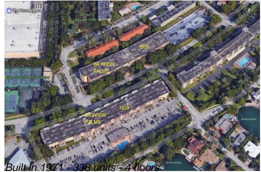
Built in 1971 - 338 units - 600+ floors