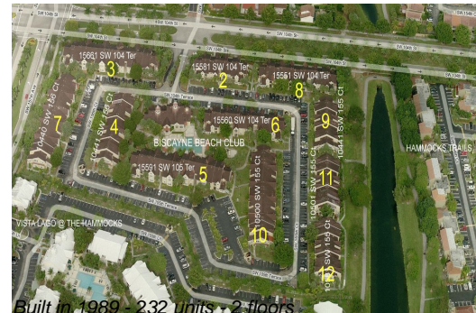
Built in 1989 - 232 units x 2 floors