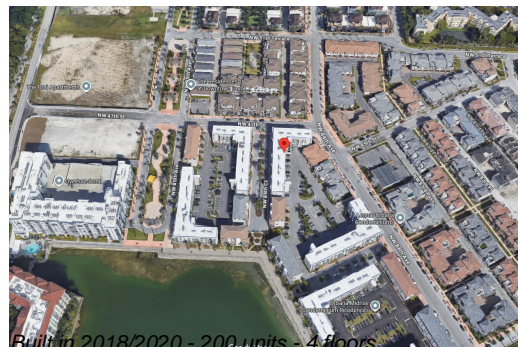
Built 2018/2020 - 200 units - 4 floors