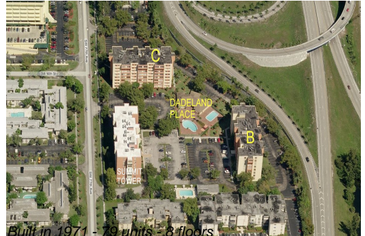
Built in 1971 - 79 units - 8 floors