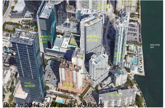
Built in 2014 - 374 units - 45 floors