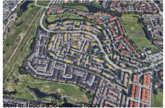
Built in 1986 - 856 units - 600+ floors