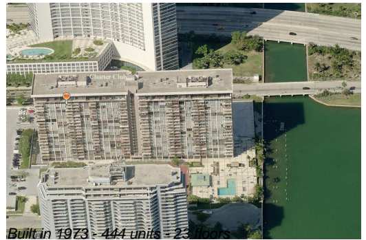
Built in 1973 - 444 units - 23 floors

The above valuated price is a baseline figure that does not take into account any specific renovation, upgrade, split, merge, or deterioration of the unit.