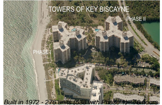
Built in 1972 - 276 units (536 with Phase I) - 46 floors