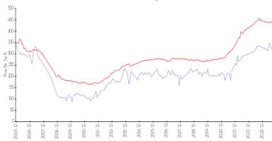
Treasures on the Bay 2 vs North Bay Village