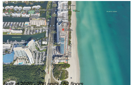
Built in 2020 - 208 units - 52 floors