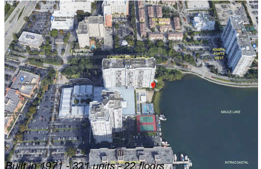
Built in 1971 - 321 units - 22 floors