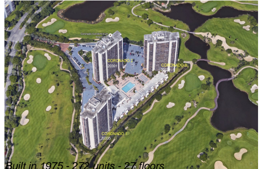
Built in 1975 - 272 units - 27 floors