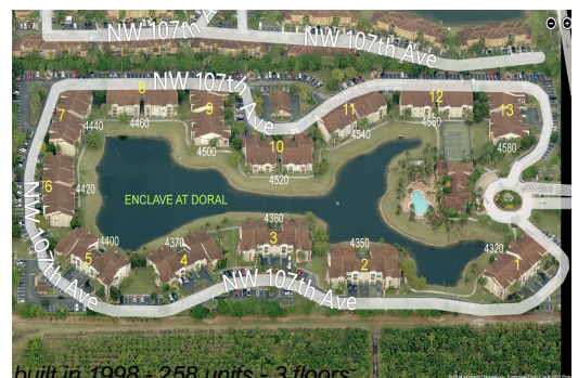
built in 1998 - 258 units - 3 floors

Doral: $356/sq. ft. Miami-Dade: $694/sq. ft.