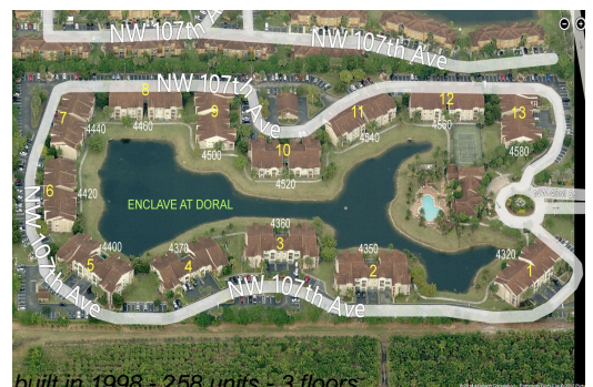
built in 1998 - 258 units - 3 floors

Doral: $356/sq. ft. Miami-Dade: $694/sq. ft.