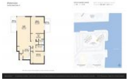
Built in 1981 - 394 units - 23 floors

The above valuated price is a baseline figure that does not take into account any specific renovation, upgrade, split, merge, or deterioration of the unit.