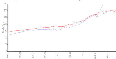
Royal Palm Place at the Hammocks vs The Crossings