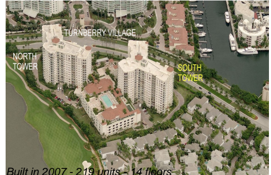
Built in 2007 - 219 units - 14 floors