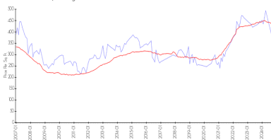
Turnberry Village South Tower vs Aventura