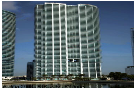
Built in 2008 - 516 units - 63 floors