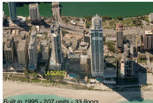
Built in 1995 - 207 units - 33 floors