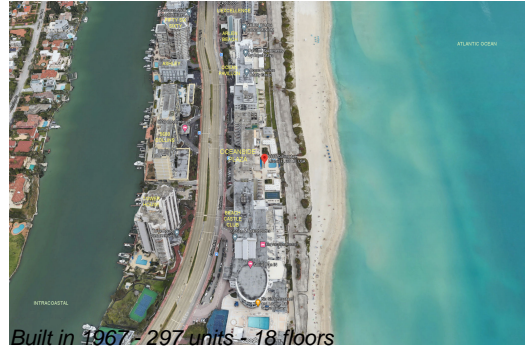
Built in 1967 - 297 units - 18 floors