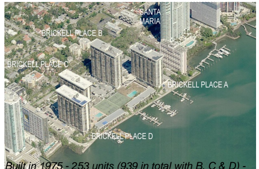
Built in 1975 - 253 units (939 in total with B, C & D) - 23 floors