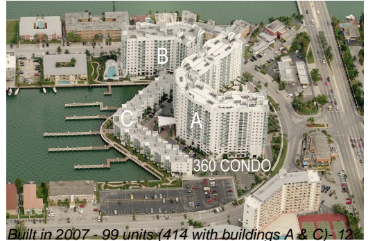
Built in 2007 - 99 units (414 with buildings A & C) - 12 floors