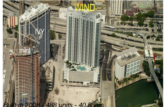
Built in 2008 - 488 units - 40 floors