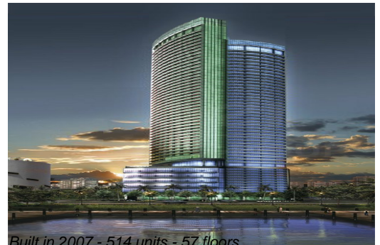
Built in 2007 - 514 units - 57 floors