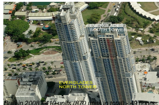
Built in 2008 - 410 units (870 units in total) - 49 floors