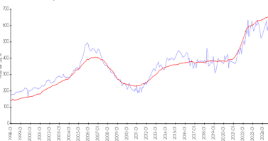
Brickell Key 2 vs Miami