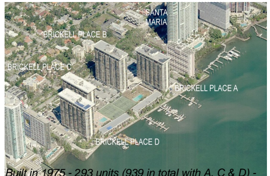
Built in 1975 - 293 units (939 in total with A, C & D) - 26 floors