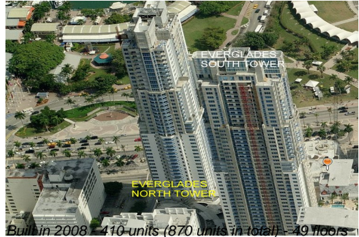
Built in 2008 - 410 units (870 units in total) - 49 floors