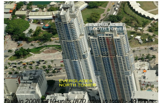
Built in 2008 - 410 units (870 units in total) - 49 floors