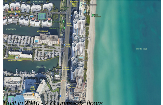
Built in 2010 - 271 units - 42 floors