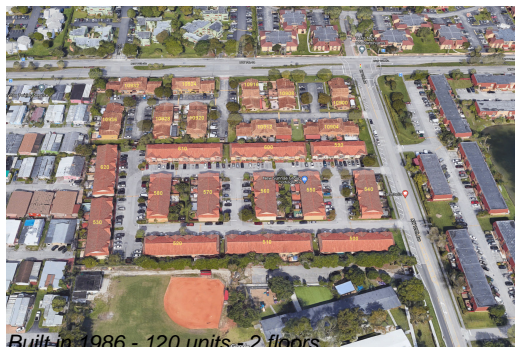
Built in: 1986 - 120 units - 2 floors