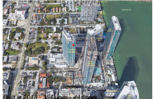
Built in 2018 - 384 units - 44 floors