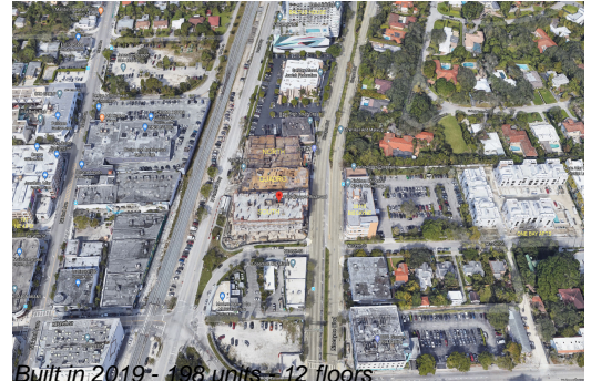
Built in 2019 - 198 units - 12 floors