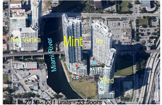
Built in 2019 - 531 units - 53 floors