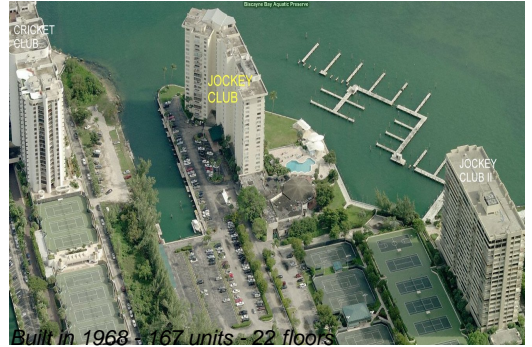
Built in 1968 - 167 units - 22 floors