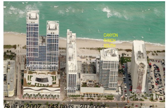
Built in 2007 - 143 units - 20 floors