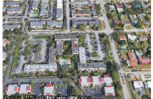
Built in 1976 - 105 units - 2 floors