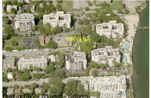
Built in 1972 - 85 units - 6 floors