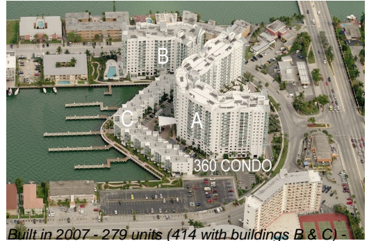
Built in 2007 - 279 units (414 with buildings B & C) - 15 floors