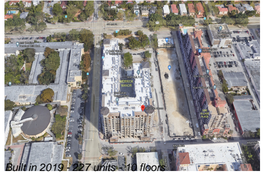
Built in 2019 - 227 units - 10 floors