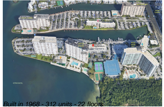
Built in 1968 - 312 units - 22 floors