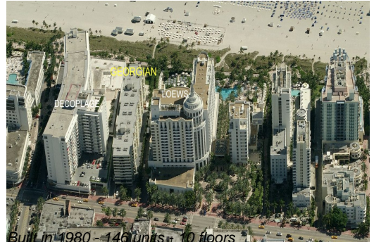
Built in 1980 - 146 units, 10 floors